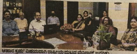
ಆಹಾರ ಕ್ರಮ' ವಿಷಯವಾಗಿ ರಾಷ್ಟ್ರೀಯ ಮಟ್ಟದ ವೆಬಿನಾರ್ ಜರುಗಿತು.