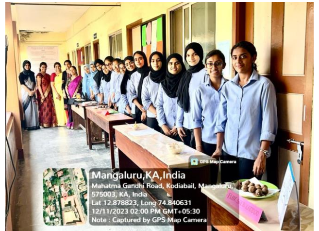
GPS Map Camera Mangaluru, KA, India Mahatma Gandhi Road, Kodiabail, Mangaluru, 575003, KA, India Lat 12.878823, Long 74.840631 12/11/2023 02:00 PM GMT+05:30 Note : Captured by GPS Map Camera