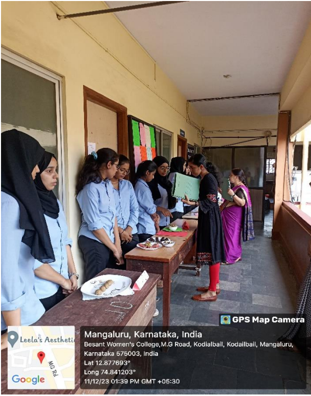
GPS Map Camera Mangaluru, Karnataka, India Besant Women's College, M.G Road, Kodialbail, Kodialbail, Mangaluru, Karnataka 575003, India Lat 12.877693° Long 74.841203° 11/12/23 01:39 PM GMT +05:30