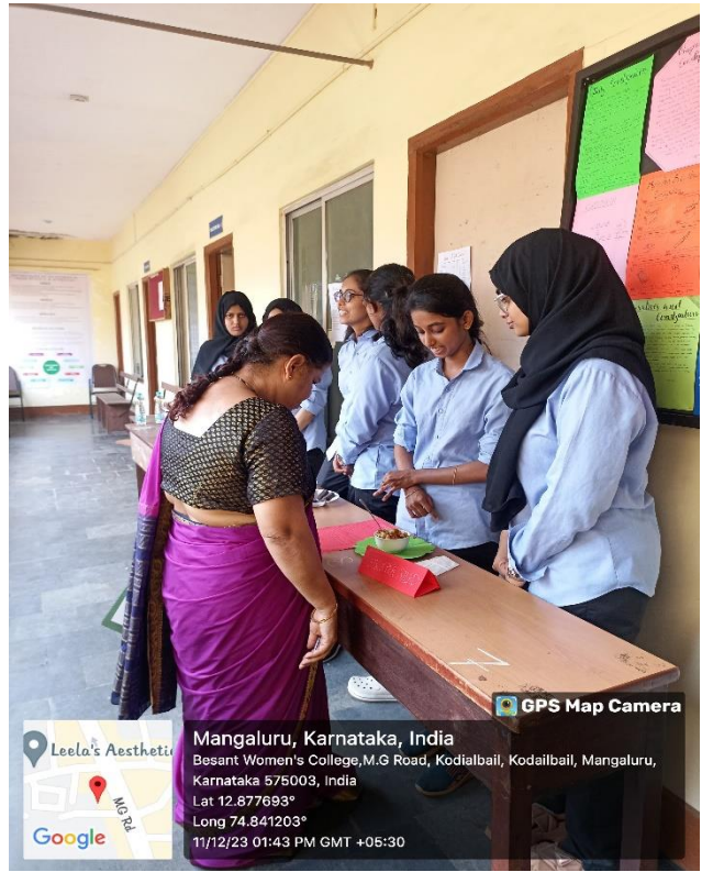
GPS Map Camera Mangaluru, Karnataka, India Besant Women's College, M.G Road, Kodialbail, Kodialbail, Mangaluru, Karnataka 575003, India Lat 12.877693° Long 74.841203° 11/12/23 01:43 PM GMT +05:30